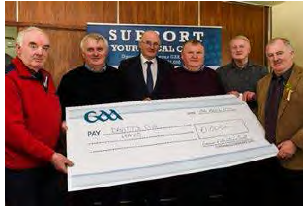
Davitts CLG Mayo, Highest ticket sellers in Connacht 2016 and 2017

If you have any general enquiries or requests relating to the National Club Draw (tickets, flyers, posters, login details etc.), please contact your NCD County Liaison Officer or email nationalclubdraw@gaa.ie . For any technical issues, please contact the support team at ncdsupport@gaa.ie