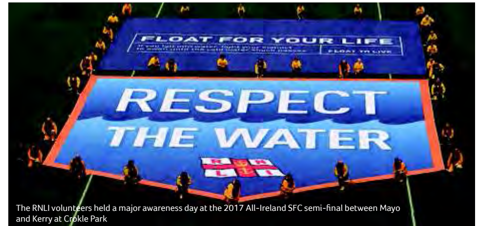
The RNLI volunteers held a major awareness day at the 2017 All-Ireland SFC semi-final between Mayo and Kerry at Croke Park

Again, we know there are a lot of asks on clubs and the Healthy Club project deals with many important issues. The RNLI has worked with the GAA to make this programme relevant to young people who lead busy and active lives. These are the people we need to reach with this message and ultimately a short presentation could save a life at your club.